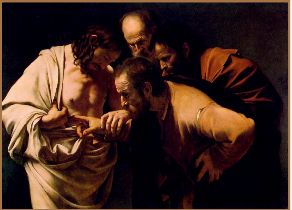
The Incredulity of Saint Thomas

Michelangelo Merisi Caravaggio, da, 1573-1610, from Art in the Christian Tradition, a project of the Vanderbilt Divinity Library, Nashville, TN.