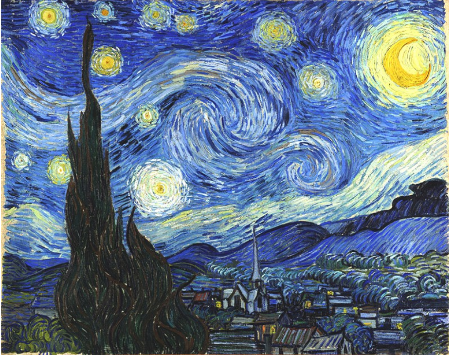
Gogh, Vincent van, 1853-1890. Starry Night Art in the Christian Tradition, a project of the Vanderbilt Divinity Library, Nashville, TN

3 Langsford Road PO Box 2740 Kennebunkport, ME 04046 207 967-5787 office@churchonthecape.org www.churchonthecape.org